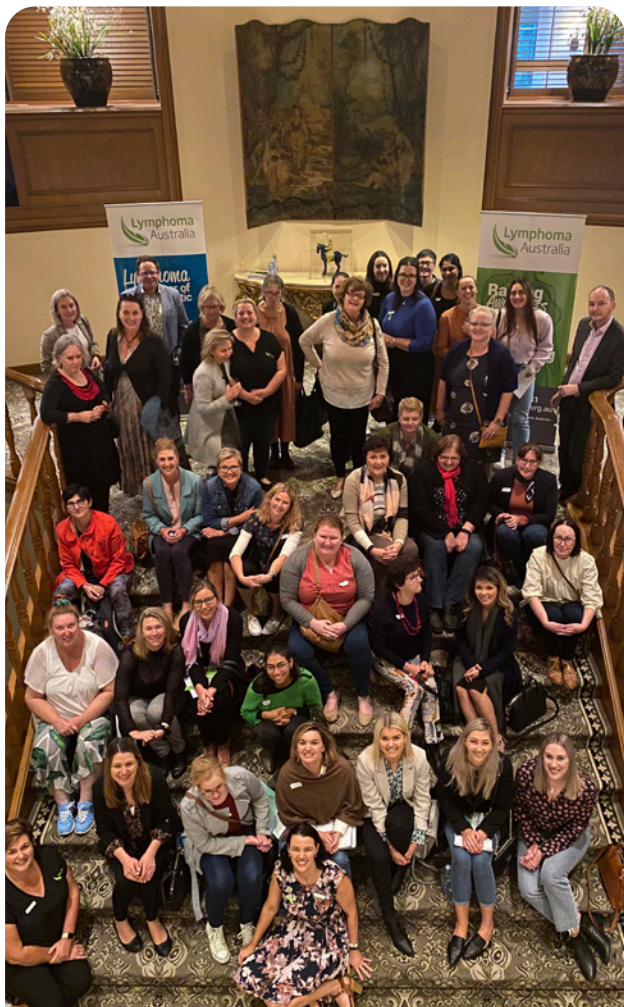
Brisbane Hub site attendees