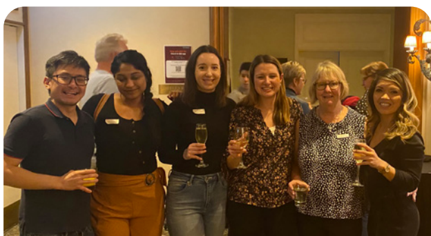
Brisbane Hub site attendees