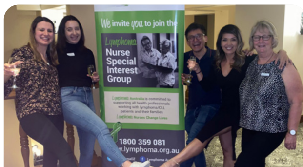
Brisbane Hub site attendees